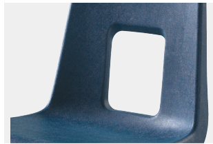
Chair Opening Provides Comfort