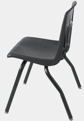
Back Angle Provokes Students Into Performance Position