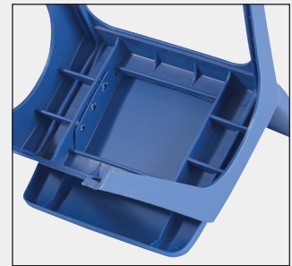
Rigid Plastic Legs Are Ultrasonically Welded for Extra Durability