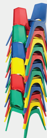
Prima Chairs Stack Up To 12' High Without Leaning