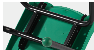
Secure Frame Attachment