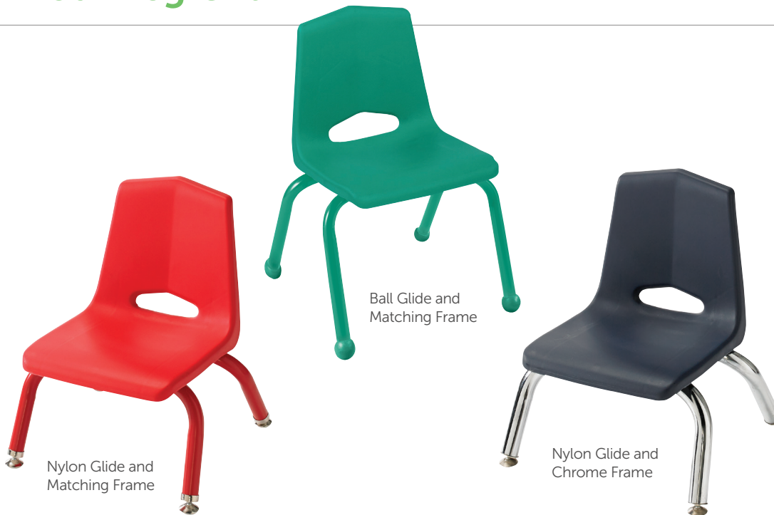
Nylon Glide and Matching Frame