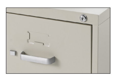
Removable Core Lock With Aluminum Drawer Pull, Label Holder and Thumb Latch