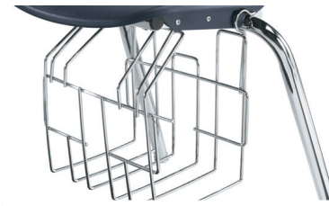
Field Installed Wire Book Basket